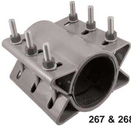
267 & 268-100