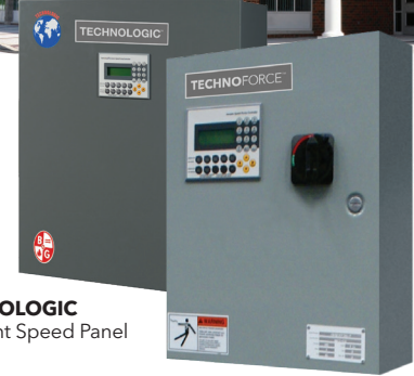
TECHNOFORCE Variable Speed Panel