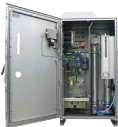
View inside: GSO 50 generator (left) and GSO 10 - 30