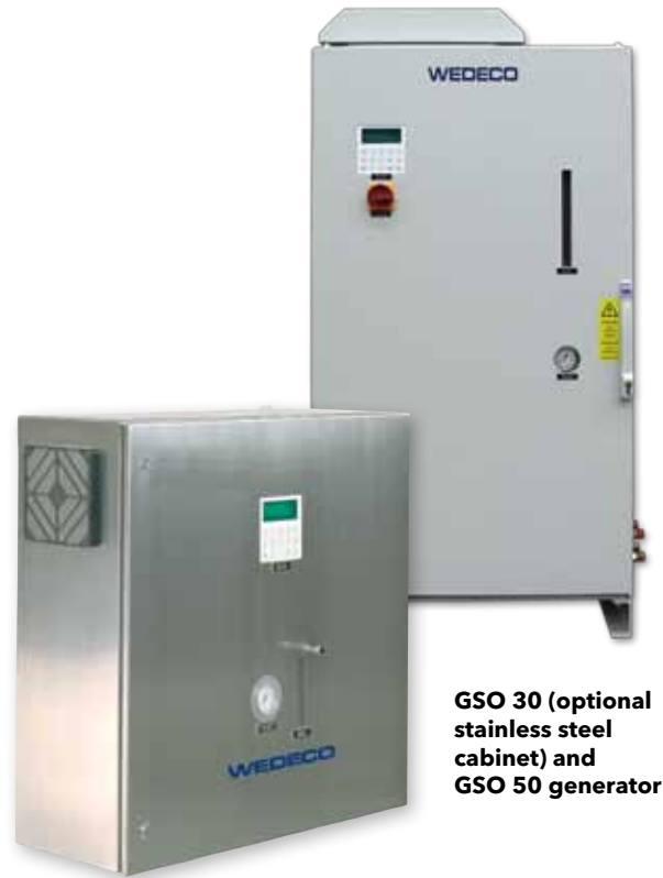
GSO 30 (optional stainless steel cabinet) and GSO 50 generator