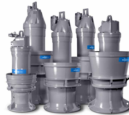
High-capacity Pumps | Standard