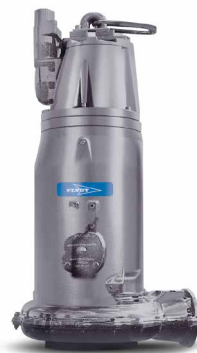
High-capacity Pumps | Standard