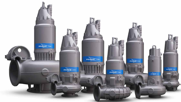
High-capacity Pumps | Standard