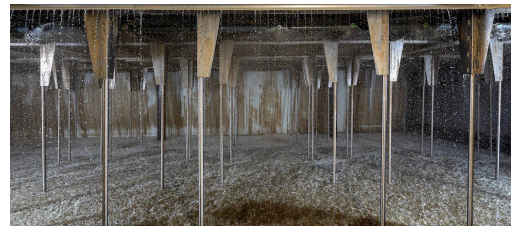
Fine dust settles through the water droplets. The cleaned air can be discharged and the residual product can be spread over the land as fertilizer.