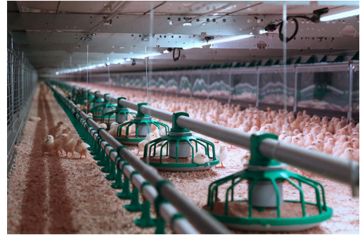
The air scrubbers are used to clean the air in livestock applications.

Finally, switching to one type of pump also helps the company realise further developments. "Many farms are also focusing on saving energy in the context of climate change. To this end, we have now developed a climate system that can be linked to the scrubber. The most important function is recovery - via a heat exchanger - of the heat contained in the air extracted from the sheds. This heat is returned to the shed, enabling the farmer to make considerable savings on heating costs."