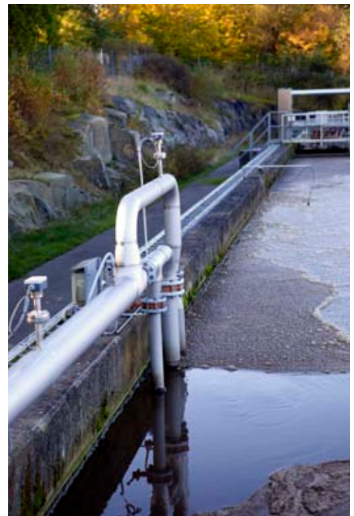
Test plant: Sternö WWTP, Sweden