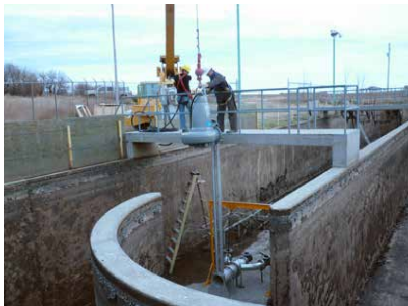
Flygt jet aeration systems are easily installed to provide both oxygenation and mixing

The town of Biggar has since ordered another pair of Flygt jet aerators from Xylem for their second oxidation ditch.