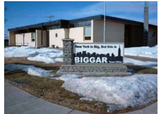
Town of Biggar in Saskatoon, SK

Xylem was asked by Catterall & Wright Engineering, the engineering firm commissioned to design the upgrades at the Biggar plant, to supply an aeration system designed to meet the required oxygen levels and provide sufficient mixing to keep the sludge from building up on the bottom of the oxidation ditch. Ease of installation and maintenance were placed as high priorities for all plant upgrades.