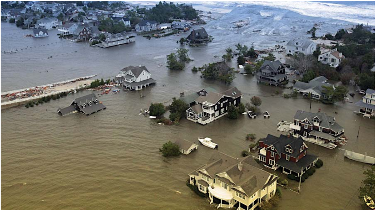
Route 35 after Superstorm Sandy made landfall.