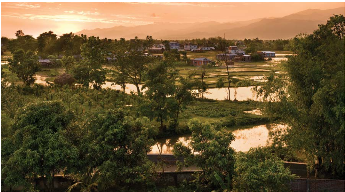
Flooded fields in Nepal.

Mercy Corps, a leading global organization empowering people to survive through crisis, build better lives, and transform their communities for good, teamed up with Xylem Watermark to bring aid to Nepal through the creation of the Disaster Risk Reduction and WASH Interventions in Far Western Nepal (DAWN) program. The overall goal of the DAWN project was to increase Disaster Risk