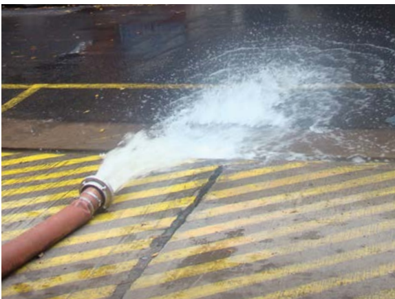
Godwin pumps dewatered approximately 30,000 cubic meters of water in Buenos Aires.