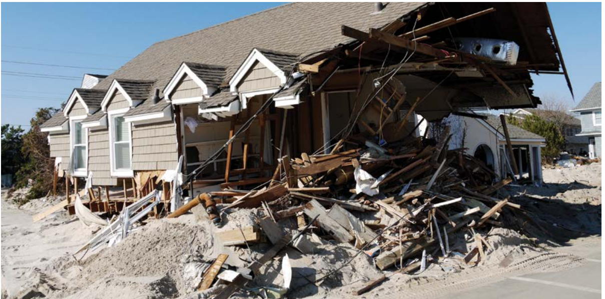
Destruction from Superstorm Sandy in Mantoloking, NJ.

The road redesign includes improvements to the pavement, utilities and landscaping, but a new drainage system featuring Xylem's unique submersible products is the key to storm-proofing this vulnerable stretch of Route 35. As part of the $265 million reconstruction project, Xylem supplied nearly 50 powerful Flygt Slimline submersible propeller pumps and another 27 smaller submersible pumps in nine pump stations along the 12-mile section of the road that was hardest hit during Superstorm Sandy. The Xylem pumps - located in concrete-encased pump stations underneath the road - are capable of working underwater, and each