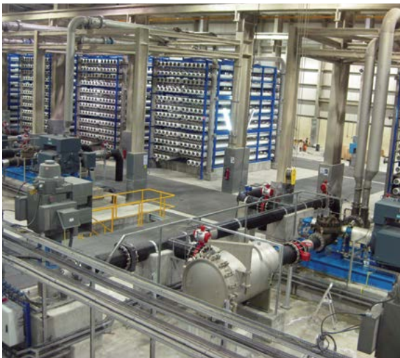
Racks of filters in a desalination plant.

To solve the pre-treatment challenges of the Jeddah plant, Doosan Heavy Industries and Construction Company, the prime contractor, selected Xylem's Leopold filter technology. The 28 Leopold FilterWorx filters, which consist of Leopold Type S underdrain, washwater troughs, penstocks, air blowers, and filter