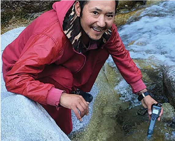
A Waterkeeper tests the local water supply.

Ladakh has also faced extreme weather events, including rare and catastrophic flash floods, worsened by rapid deforestation that has removed nature's flood-defense mechanisms. In August 2010, flash floods in Ladakh damaged over 71 towns and villages, claiming 225 lives. Floods in September 2014 killed more than 550 people in the Kashmir region and devastated the livelihoods of survivors. These incidences, which are expected to become more common, have been termed "Himalayan tsunamis."