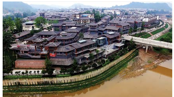
Lushan, Sichuan, China.