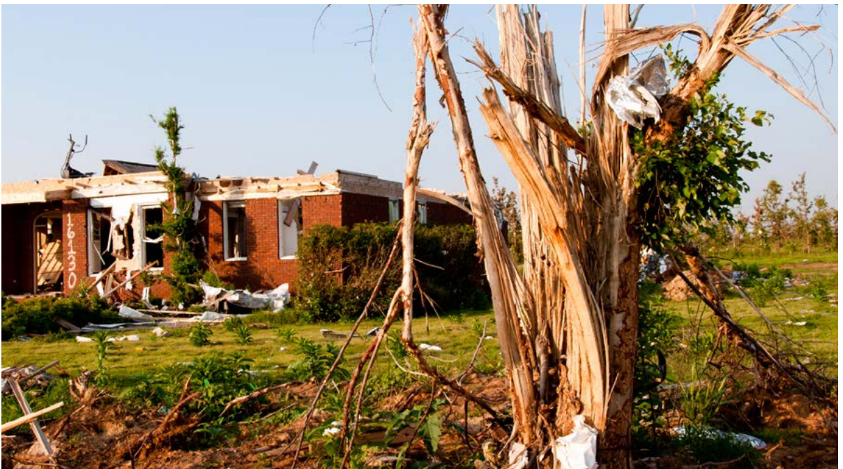
A tornado-damaged home in northern Alabama after the 2011 disaster.