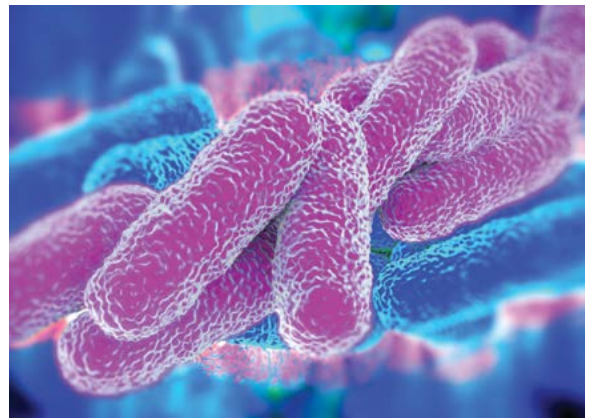
Legionella pneumophila bacteria.

Unfortunately, the Legionella outbreak in Warstein is not an isolated incident. The United States Center for Disease Control (CDC) reported the number of people with Legionnaires' disease globally grew by four times from 2000 to 2014. In an effort to reverse this increase, Xylem has partnered with DC Water and Corona Environmental Consulting on a project to eradicate Legionella outbreaks in Washington, D.C. The objective is to create a scalable project that can be employed by cities around the world. The project includes testing for the bacteria at treatment plants, conducting focus groups, and surveys of utilities and building owners. By collaborating with cities and water professionals, Xylem hopes to continue making headway in the effort to eradicate Legionnaires' disease around the world.