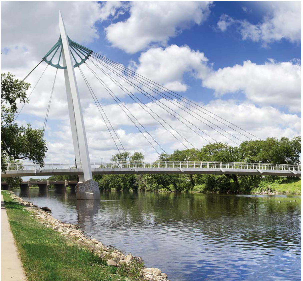
The Little Arkansas River running through downtown Wichita, Kansas.

Since beginning operation in 2013, this project draws 30 million gallons of excess water each day from the Little Arkansas River, treats it, and injects it into the underground aquifers to ensure that wells in the surrounding area will continue to supply clean water to Wichita residents. Since the project's inception, the aquifer's levels have increased by nearly 15 percent and it is now 95 percent full. Xylem is proud to have partnered with the City of Wichita to renew its water supply.