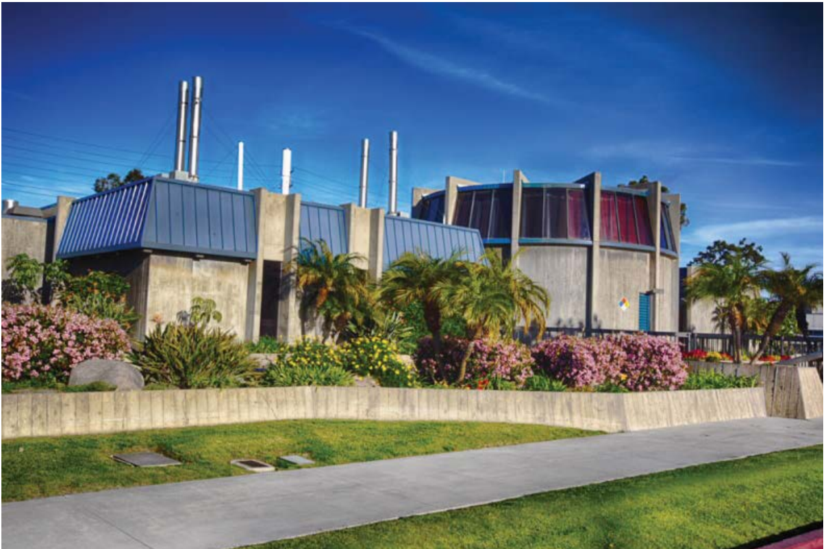
The Terminal Island Water Reclamation Plant (TWIRP), located in Los Angeles.