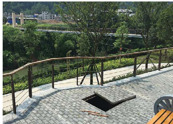
A well-hidden access point to the underground system in Lushan's scenic area.

The integration with the surrounding environment of the scenic area, combined with the stable operation of Flygt integrated pump station, serves as a testament to Lushan's ability to collaborate and rebuild. Now, the restored Hanjiang Ancient Town is striving to become a national AAAA-grade tourist attraction.