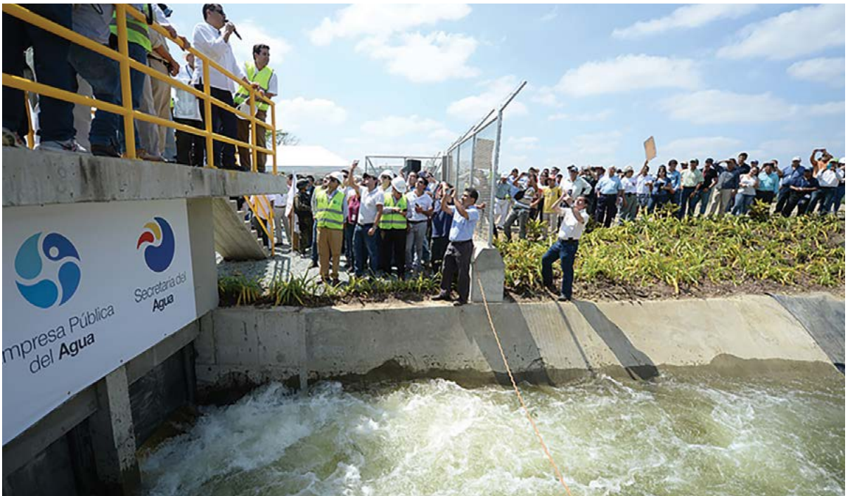
Construction crews, city officials, and citizens celebrate the opening of the new system.

contractor in Ecuador and Xylem’s local Flygt representative, Ivan Bohman Cia, who worked in concert with the Ecuadorian Water Secretariat, Senagua. To support this endeavor, Xylem supplied Flygt Custom Pumps with A-C customized hydraulics for optimum efficiency. These custom pumps now enable the irrigation of an arid region of 7,700 hectares in the Javita River Valley, transforming it into viable agricultural land. The $39 million project will meet both drinking water and irrigation needs of the river valley’s residents for years to come.