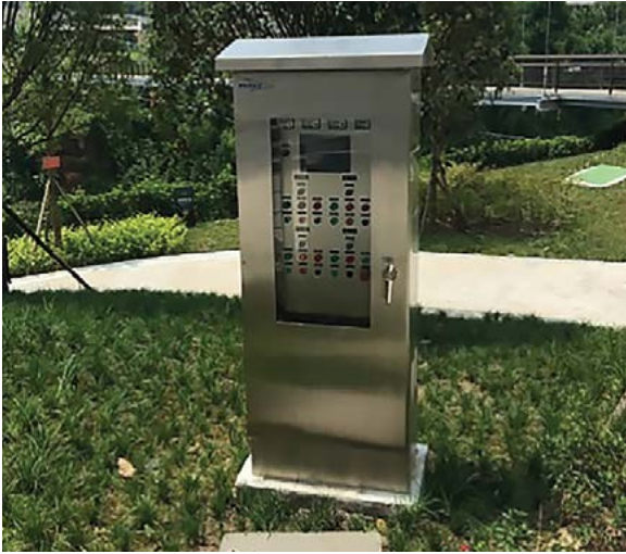
The only visible aspect of the underground system in Lushan.