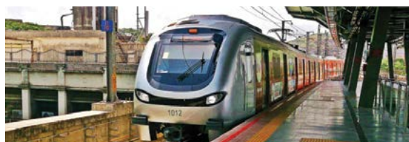
A metro train passes through Mumbai, India.