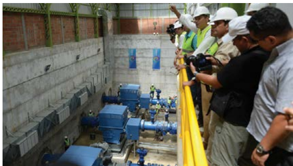
Crews look below to the newly installed Flygt pumps for the Transvase Chóngon-San Vicente project.

“When there was a drought, there was no water for the animals, for the pasture, or for irrigating the produce we consumed and much less for crops for sale,” an Ecuadorian citizen lamented in an interview with the World Bank. Ecuador, a country that is home to diverse biomes of desert, alpine, dry forest, and rainforest, is often subjected to both drought and flood conditions. This variability makes farming difficult, especially without irrigation systems, which can help provide a steady supply of water to crops. “It’s heart-breaking, living so close to the river and yet having no water for the fields, having to rely on rains for the harvest to yield,” another resident added.