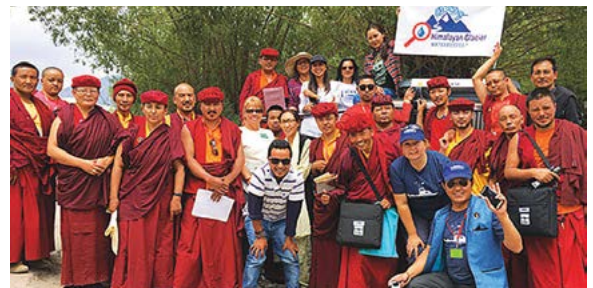
Members of the Himalayan Glacier Waterkeeper team.

Protecting the Himalayan glaciers, rivers, and the countless communities that depend on them is a colossal challenge, but the Waterkeepers in the Ladakh, Bhutan, and Himalayan communities are optimistic.